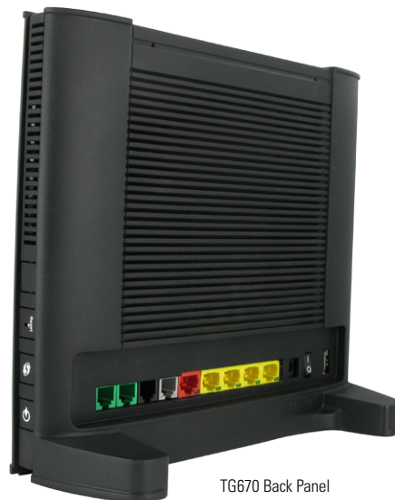
TG670 Back Panel

Technicolor Professional Services are available to address your demands for qualified technical support & warranty, product maintenance, access to training courses and tailor-made solutions to specific product evolution. For more information, please ask your usual contact person.